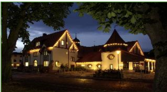
Conference Room in Wicom-Forum

For booking the hotel-rooms and the conference, please send a mail to weinbau.antes@t-online.de