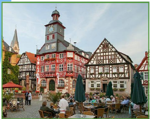
Market place Heppenheim, "Goldener Engel"

Hotel „Goldener Engel“ is placed at the market-place in the middle of the historic centre in Heppenheim: www.goldener-engel-heppenheim.de